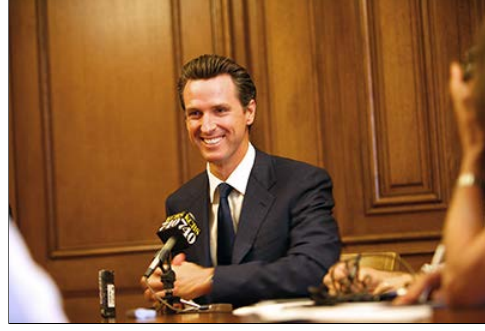
New York Times

On Jan. 1 AB 1014 will go into effect, creating a system for obtaining gun violence restraining orders, and wording was finalized last week for a five-pronged gun control measure Lieutenant Governor Gavin Newsom is hoping to land on the presidential election ballot next November.