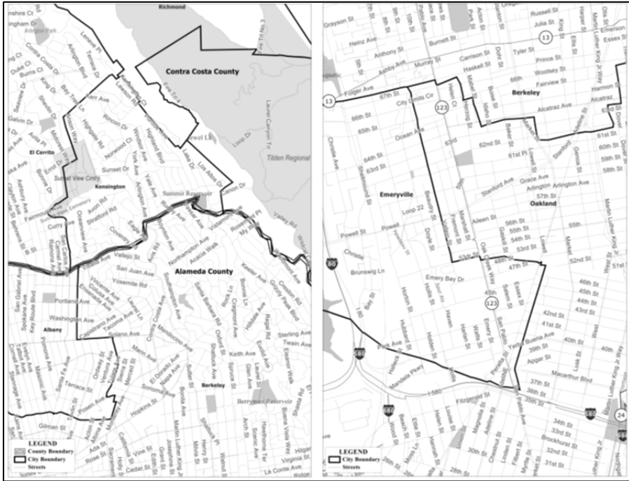
Map A: County Boundaries of Contra Costa and Alameda Along the El Cerrito (Contra Costa County) and Albany (Alameda County) Borders, City and Boundary Lines of Emeryville and Berkeley Along the Oakland Border