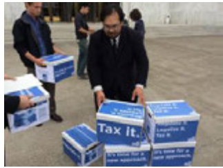
( http://mediad.publicbroadcasting.net/p/northwestnews/files/201406/062614CL_oregonpot.jpg )

Three of the measures on this year's ballot are making repeat appearances after voters rejected similar versions in the recent past. Oregon voters have already voted on recreational marijuana, a top-two primary, and labeling genetically engineered foods.