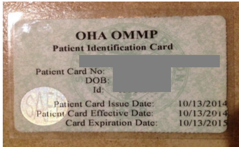
OMMP Patient Card.

Similar cards are also issued for Primary Caregivers and Designated Growers